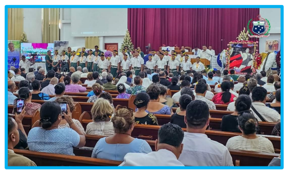
The Church service was held at the Seventh Day Adventist Church in Lalovaea.