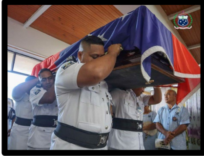
Samoan Police force carrying the casket.

The Samoan Prime Minister Fiame Naomi Mata'Afa delivering a eulogy on behalf of the Government of Samoa.