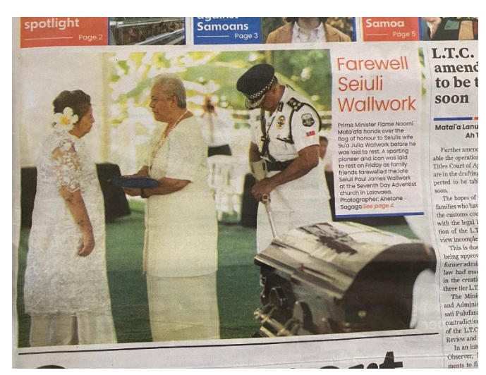
Front Page of the Samoa Observer Newspaper.