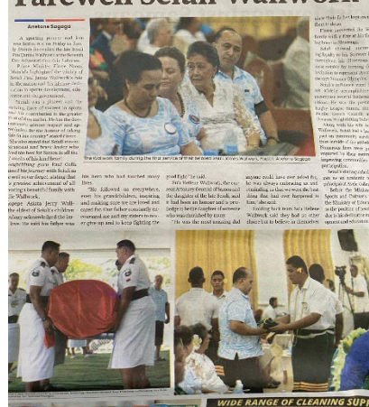
WIDE RANGE OF CLEANING SUP